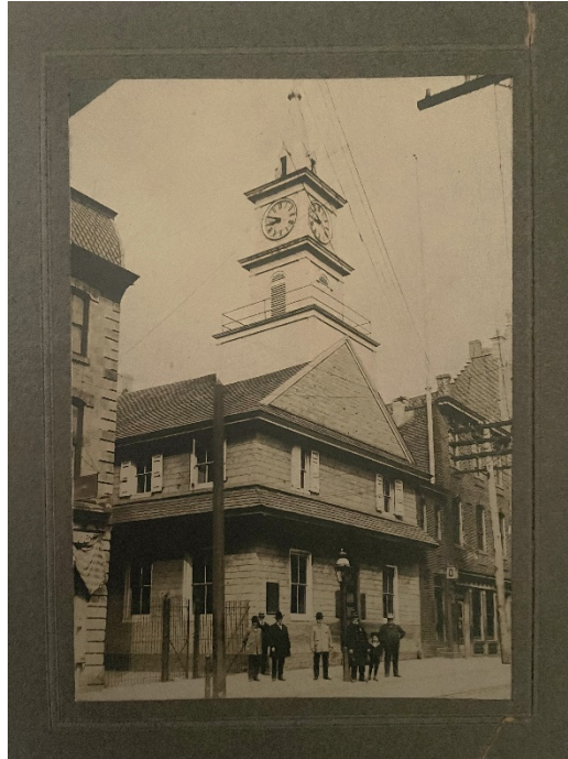
Photo: The 1724 Chester Courthouse picture circa 1880-1890's. The Marquis de Lafayette visited here on his grand tour in 1824, just when the courthouse turned 100 years old!