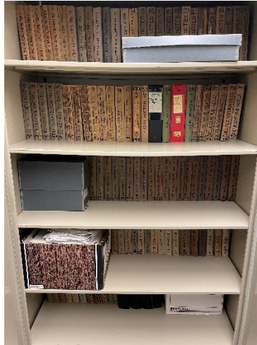
The Chester F. Baker Collection at DCHS.

Delaware County Historical Society (DCHS) has successfully moved to new location in Media, at 9 W. Front Street! After nearly two years of indexing, organizing, and culling through the collection, DCHS was able to safely move the collection to new quarters. DCHS will have a grand re-opening celebration on Thursday September 26 at 10 AM, with a ticketed event to follow at 6:30 PM at Media Borough Hall. Please click the link here to reserve your ticket today!